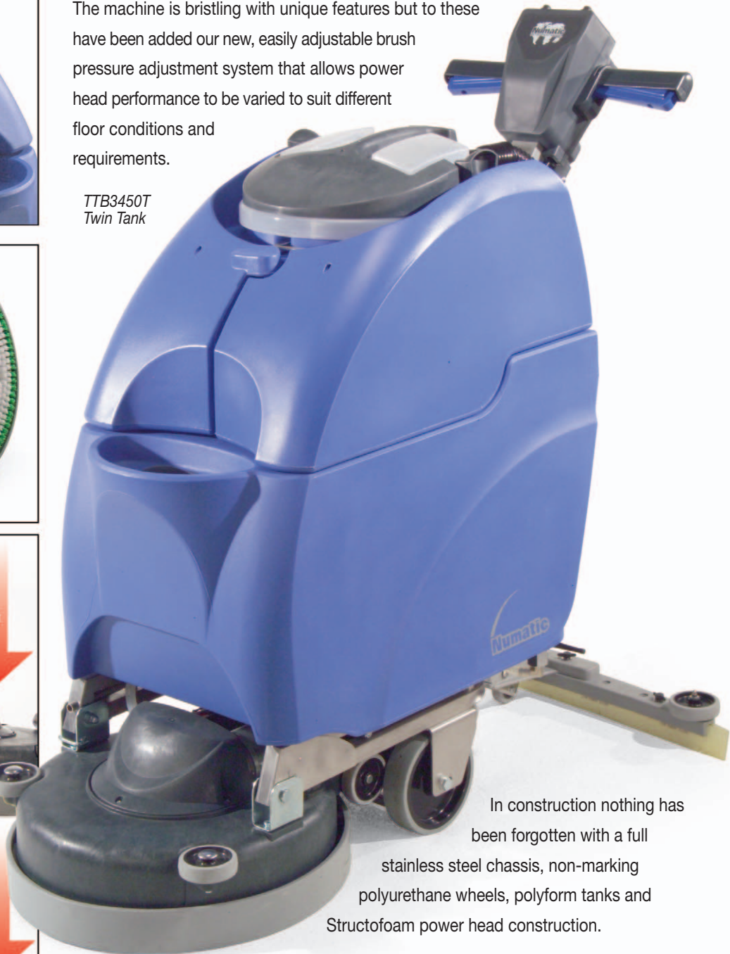
TTB3450T Twin Tank

In construction nothing has been forgotten with a full stainless steel chassis, non-marking polyurethane wheels, polyform tanks and Structofoam power head construction.