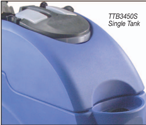
TTB3450S Single Tank